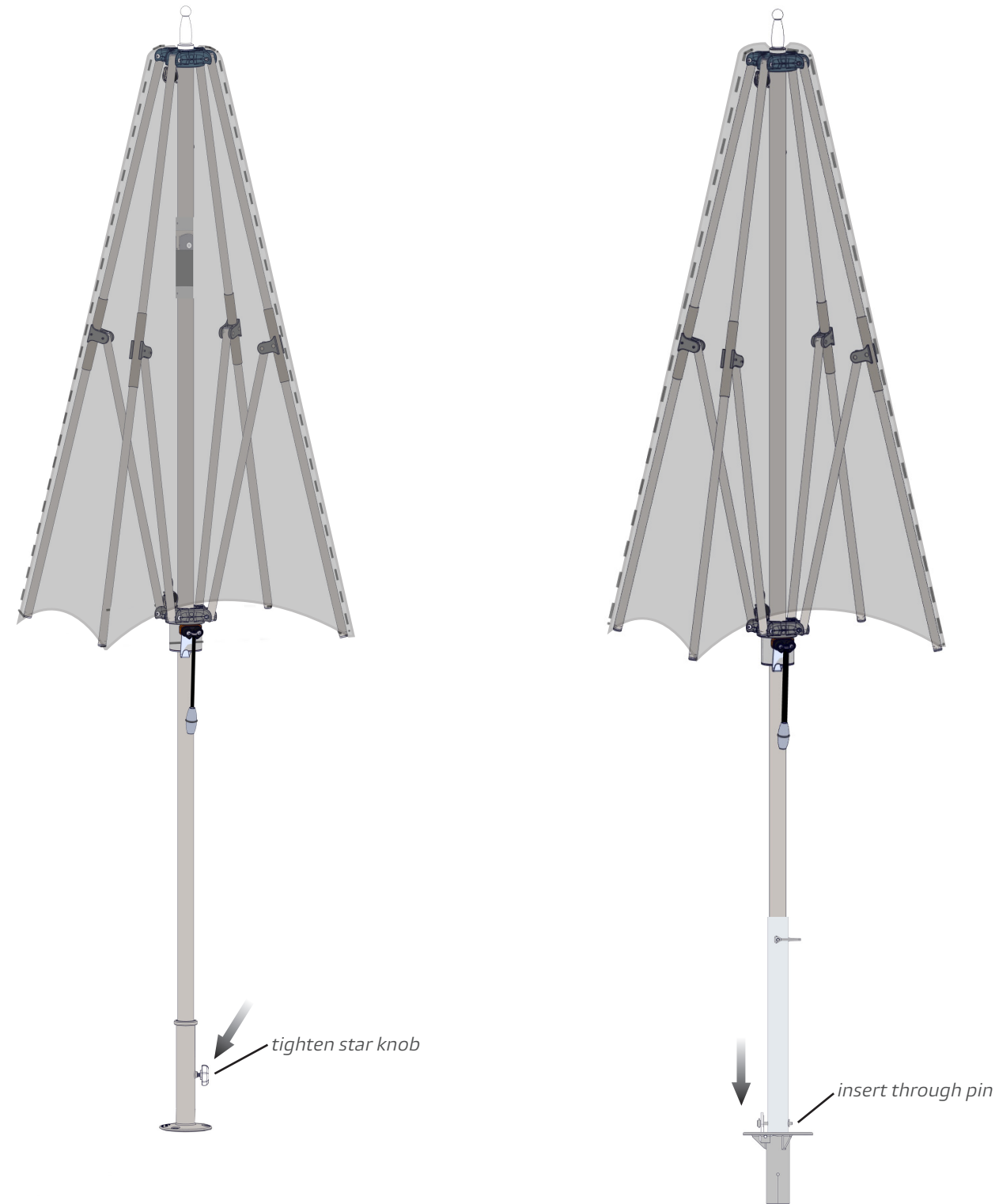
a with above ground base